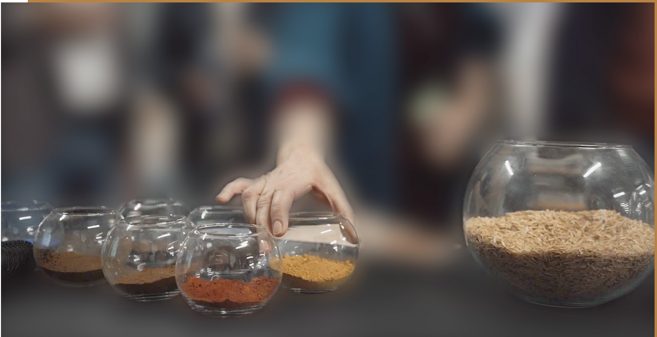
Terrae-Calce Natural pigments and aggregates

Terrae-Calce was selected for its unique composition of lime and natural aggregates, which create a smooth yet subtly variegated surface.