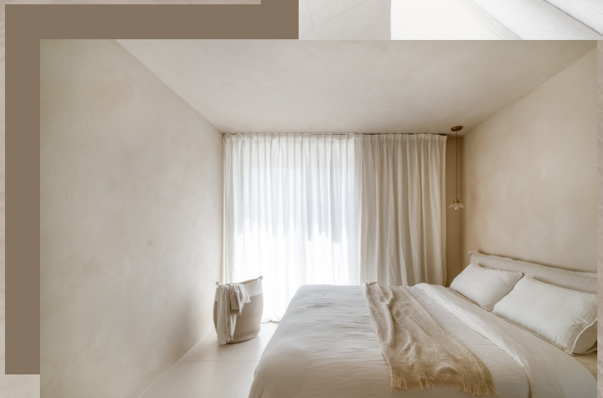
Photo Credit: Tine Peeters @Aperture 8.6 Project installation: Texture Painting, Belgium